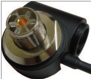
This is a mount with a UHF Female (SO-239) connector