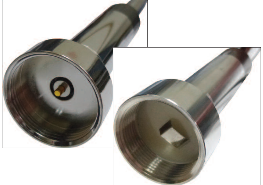
These two are NMO connectors, They are the same connector just built a little different.