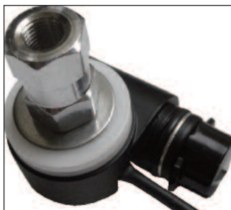
This Mount has a 3/8x24 nut on it, fits heavier screwdriver and most CB antennas.