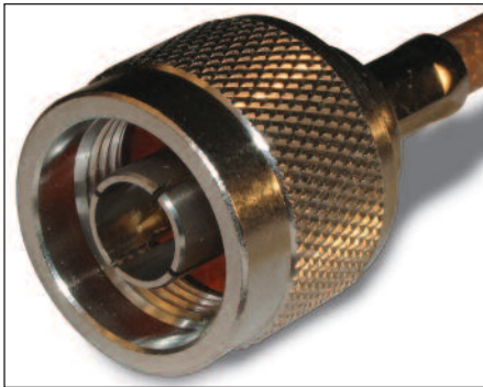
This is the male version of the Type N Connector. Mates With Female N