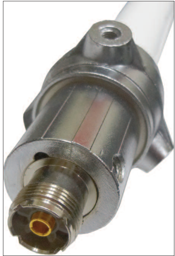
This is the Female version of the UHF Connector Also Known as the 50-239