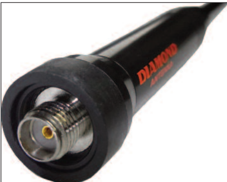
SMA Female (Left), mates with radios, or cables with SMA Male (right)