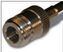
Mobile antenna with Type N Male mates with a mount with Type N Female