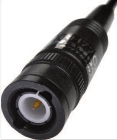
BNC Male (Left), mates with radios, or cables with BNC Female (right)