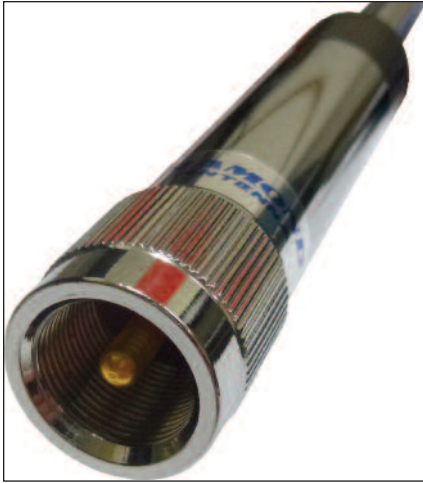
This is the male version of the UHF Connector Also Knows as the PL-259 Mates with Female UHF (SO-239) mount (shown below)