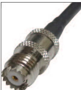
Mini-UHF Female (Left), mates with Mini-UHF Male (right). This connector is used on many different cables Diamond Antenna sells