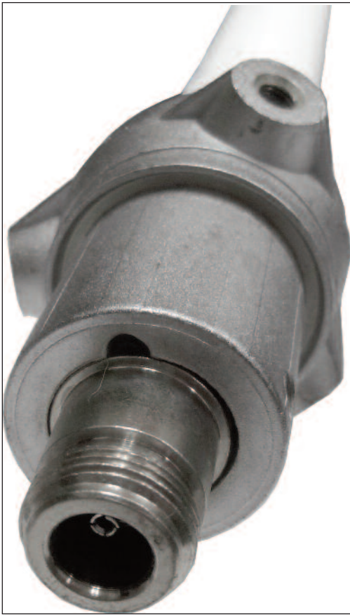
This is the Female version of the Type N Connector.