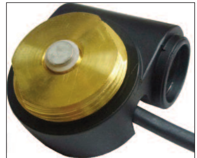
This is a mount with a NMO connector on it.