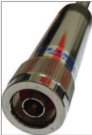
This is a mobile antenna with a Type N Male as its connector